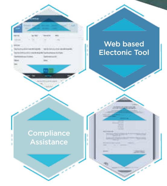
IRCLASS Academy can arrange tailor-made awareness workshops as desired to impart training on IMO Data Collection System